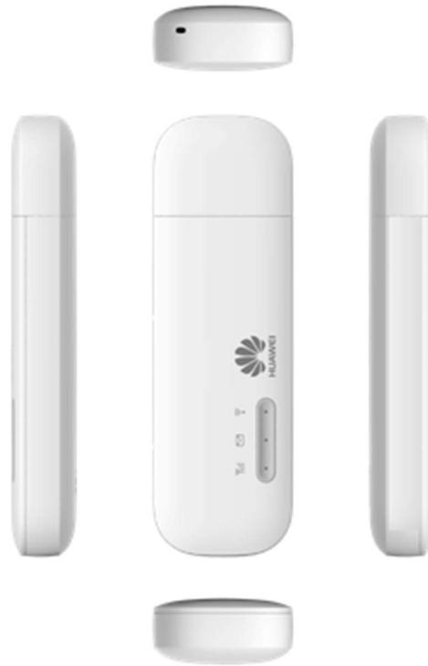
Figure 1-1 E8372 profile

Figure 1-1 shows the profile of the E8372.