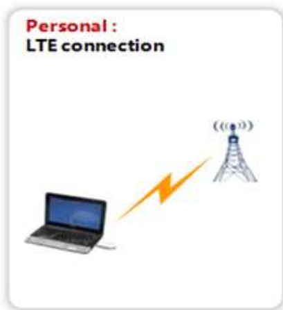
Figure 3-1 shows the device connecting to the network by USB.

After you connect the E8372 to a PC with the USB interface, you can send or receive E-mail, access the network through wireless connection, and download files through wireless data channels.